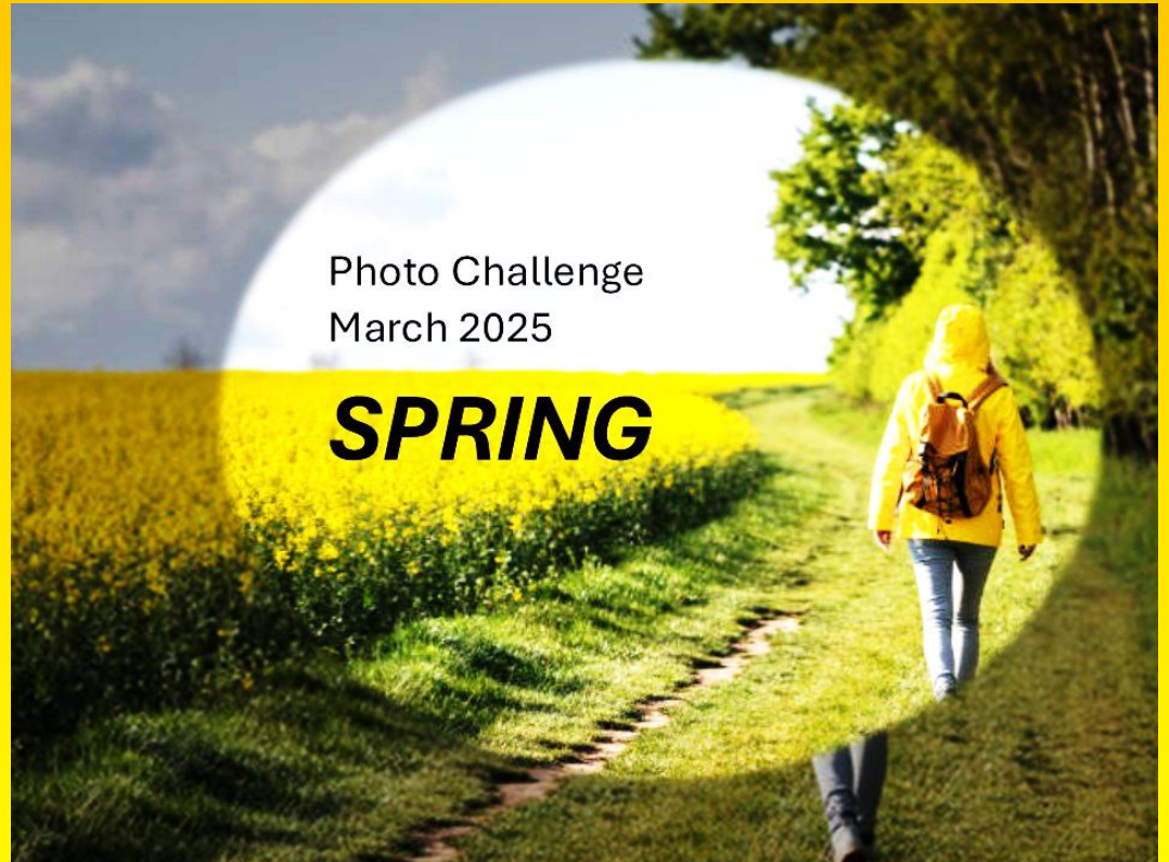
Photo Challenge March 2025