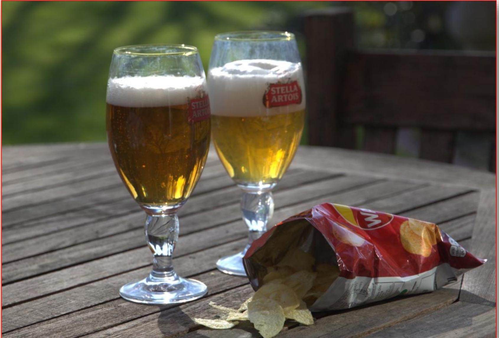
David – 2 Lagers & A Packet Of Crisps