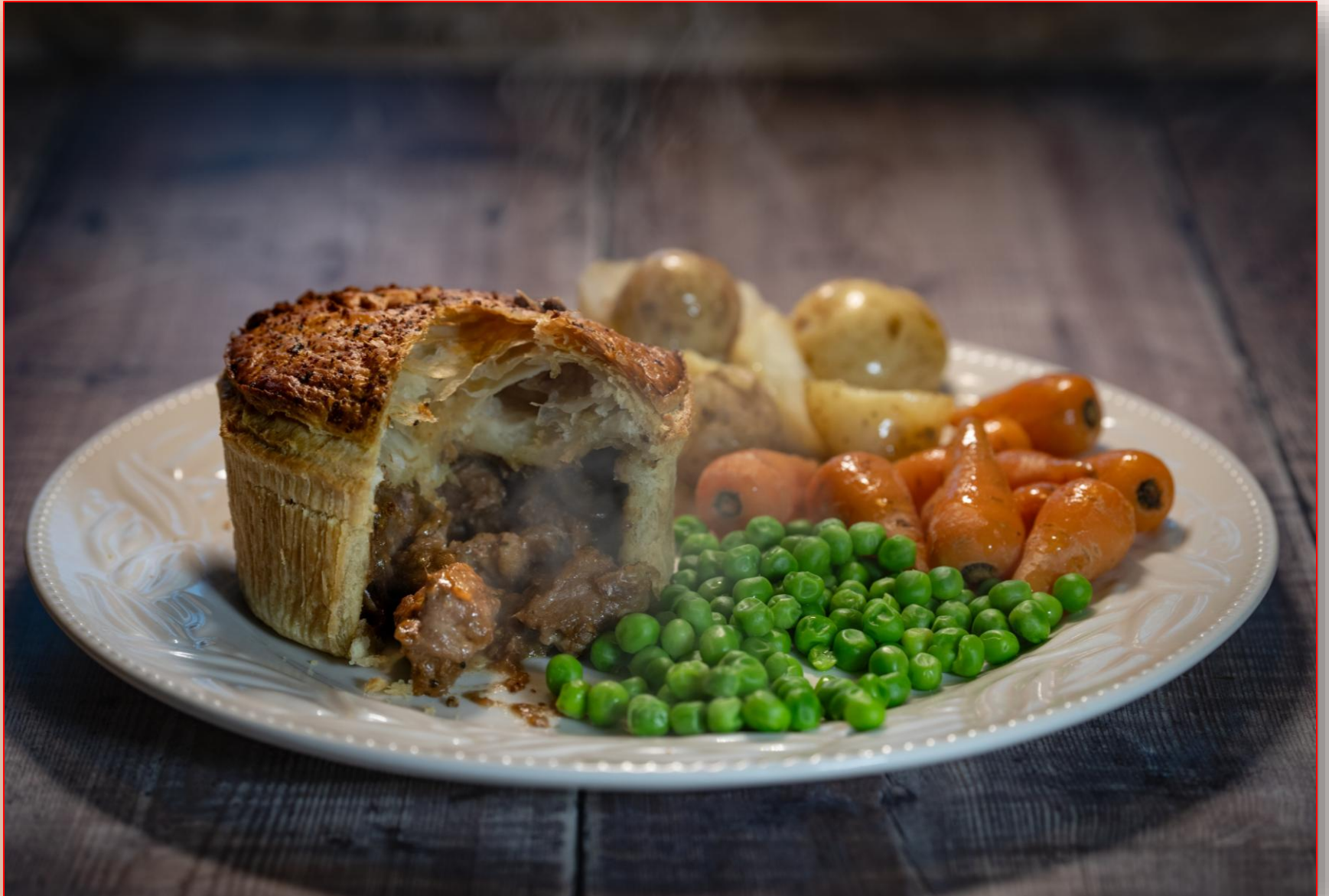
Jo – Kosher Food